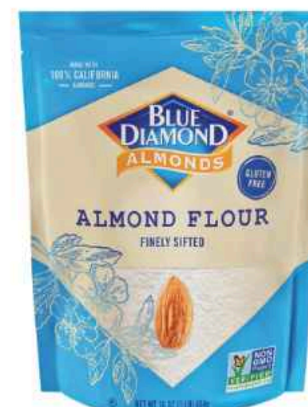
Blue Diamond Almond Flour 16 OZ