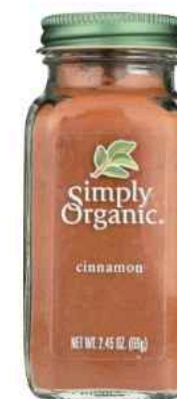
Simply Organic Organic Cinnamon 2.45 OZ