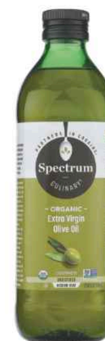
Spectrum Naturals Organic Extra Virgin Olive Oil 25.4 FL OZ