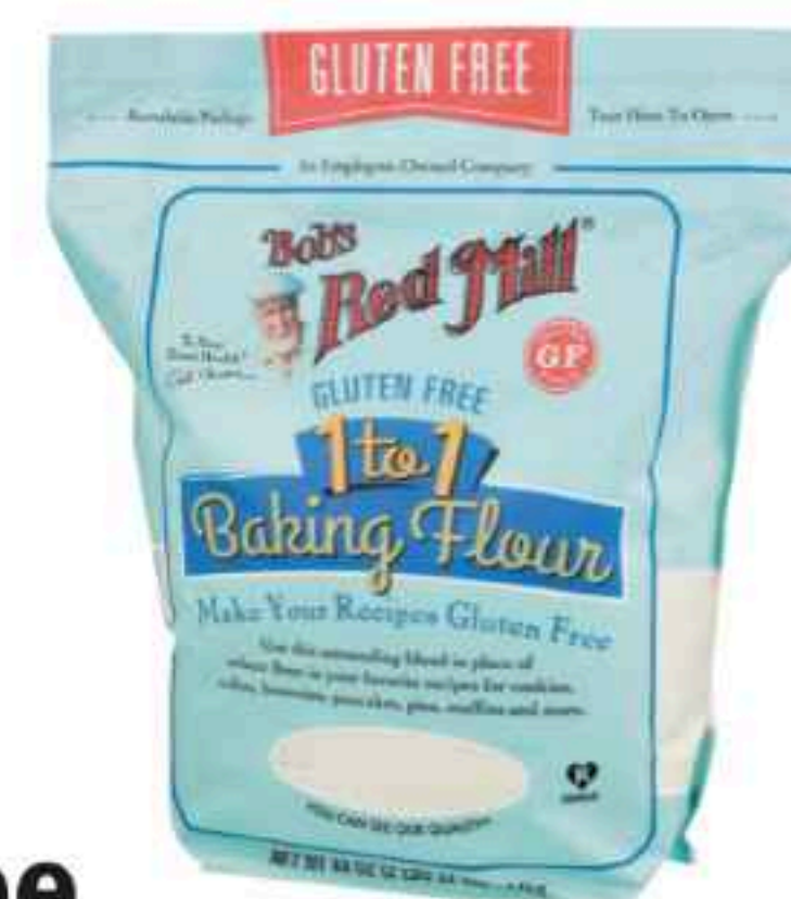
Bob's Red Mill Gluten Free Baking Flour 1-to-1 44 OZ